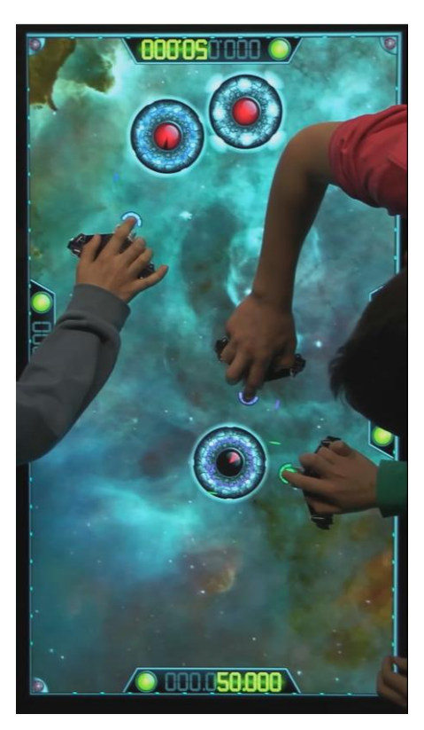
Figure 1: Children playing the game. Players have the task to collaboratively defend the earth against alien invaders. They can either attack on their own (player to the left) or work together (players to the right) to be more efficient, thus collaboration is only encouraged and not enforced.

manifestations, which are referred to as "autism spectrum disorders" (ASD). Children with ASD have impairments in social interaction and communicative skills and show stereotyped or repetitive behavior [1]. ASD can be recognized at all levels of intelligence. ASD's are not curable. Intervention strategies focus on decreasing symptoms by improving everyday interactions. In behavioral therapy, positive reinforcement is used in order to train desired behaviors. An easy way to provide this reinforcement is through so called "therapeutic games" or "health games". The effectiveness of such games can be improved by hybrid technology. Games based on such technology are often referred to as "hybrid games", which have the means to blend together digital and analog advantages [9], such as haptic and social elements of analog games and audiovisual possibilities of digital games. This combination of analog and digital advantages can now be used for therapeutic games for children with ASD. Recent studies [4, 6, 12] prove the potential of using hybrid interactive surfaces [7] for therapy games to help in treating HFA and AS. There is reason to assume that players are motivated and feel secure in the digital setting [12]. At the same time, the form factor allows face-to-face communication between the players thereby fostering real-life social interaction. Children with ASD might "benefit from the social computing experience provided by tabletop technology" [12].